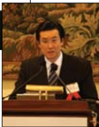
Hon. Kenji Shinoda